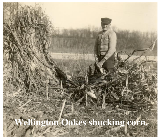
Wellington Oakes shucking corn.