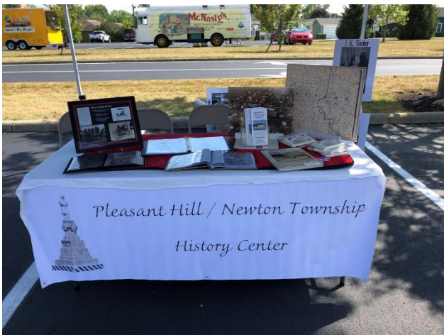
Our History Center booth at the Farmer's Market and the Christmas Bazaar - 2021

Be sure to check our web site at Pleasanthillhistorycenter.com and visit us on Facebook