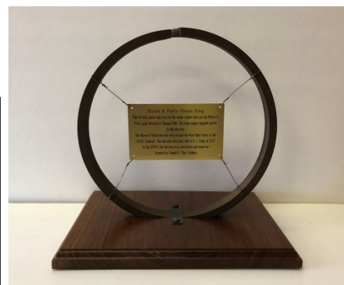
Steam Engine Piston Ring