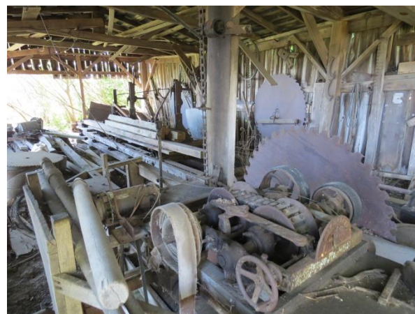
Deeter Saw Mill was purchased and reassembled on the Robbins farm.