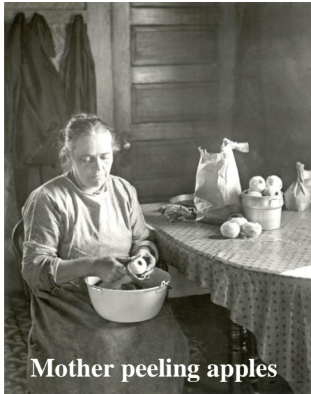
Mother peeling apples