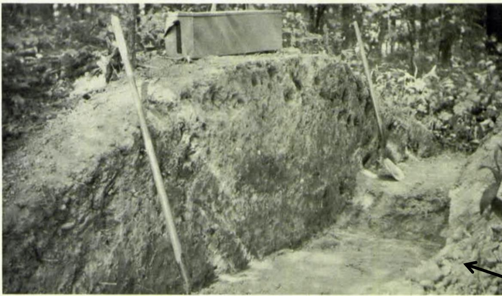
Fig. 2 (Allman)--Trench cut through embankment.

A charcoal sample from the site was sent to the University of Michigan. They dated the material to between 1300 and 1600 A.D.