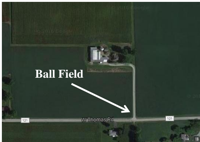
West Milton Record June 13, 1923