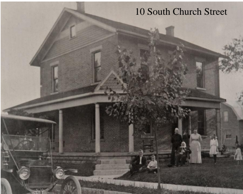
10 South Church Street