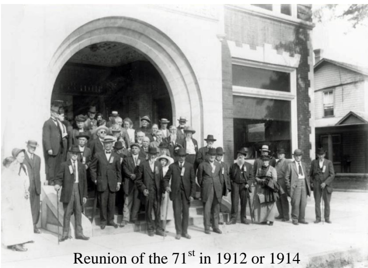
Reunion of the 71 st in 1912 or 1914