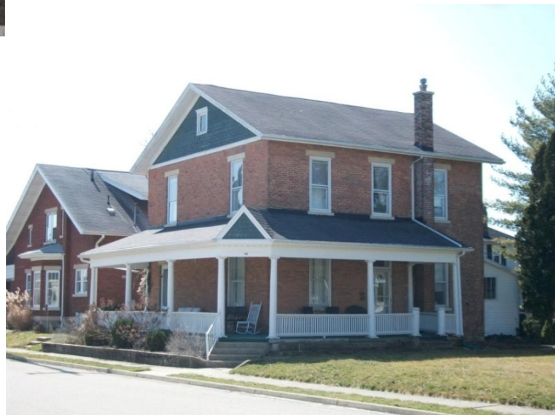
10 South Church Street - circa. 2014

This building which is now 155 years old still stands as a monument to the early schools of Pleasant Hill.