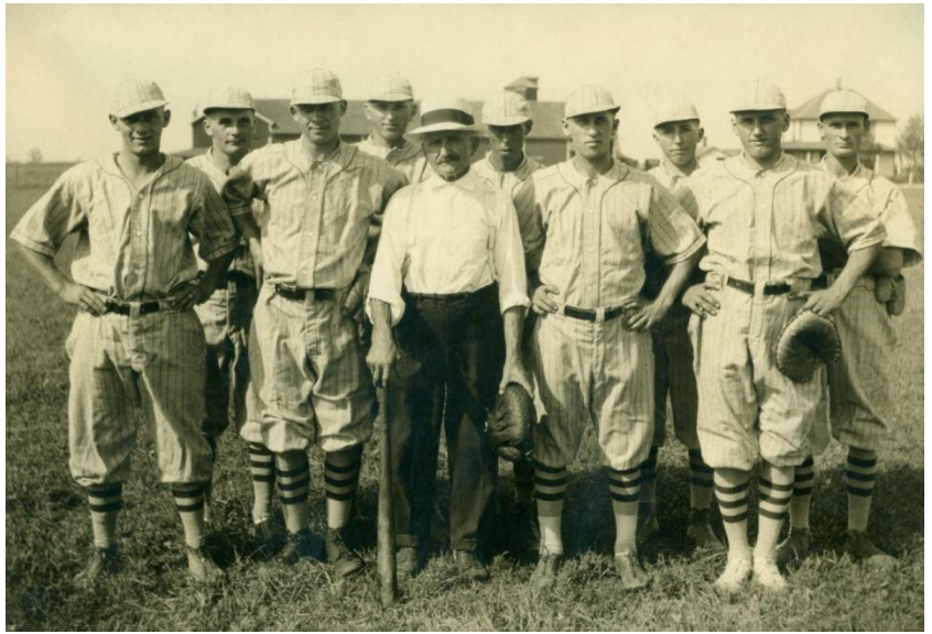
Fall of 1922