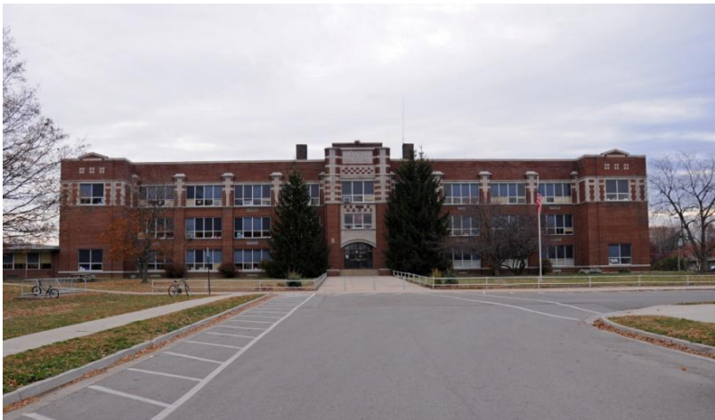
In the spring of 2010, the building was torn down to make room for the next new school building in Pleasant Hill.

New windows were installed in the summer of 1965 and additional rooms were added. The cafeteria was moved into the new addition and the science rooms were moved into the former cafeteria space.