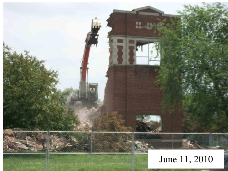
June 11, 2010

On February 8, 1924, just a few months after opening, the building was closed due to lack of funds. The school was reopened March 17, when the Ohio Supreme Court ruled that the school could borrow against future tax revenues.