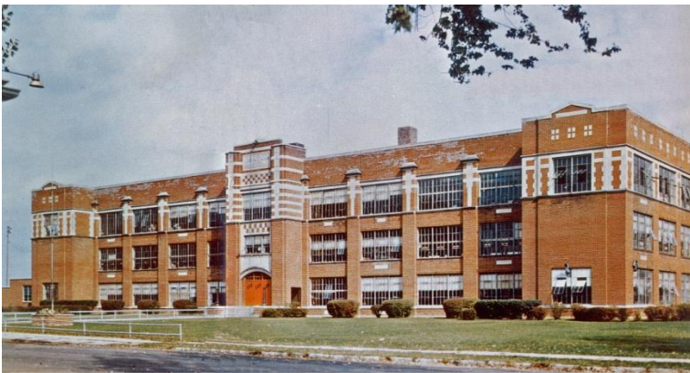
The building before the new windows were installed

The first day of school was formally opened on October 8, 1923. The new building contained 51 rooms including a gymnasium and auditorium. Eighteen passenger trucks were used to transport the students to the new building.