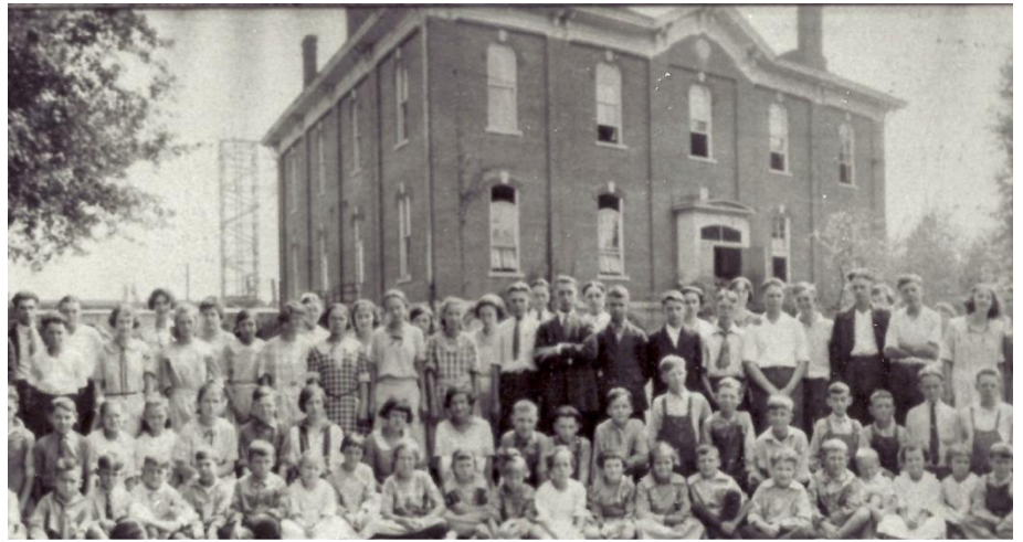
Scaffolding for the new building can be seen behind the 1875 building.